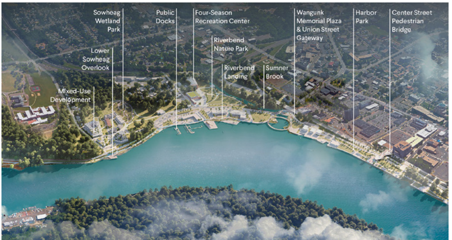
2023 ASLA Connecticut Professionals Awards: “Return to the Riverbend” (Middletown, CT) by Langan (in collaboration with Cooper Robertson) Category: Landscape Planning & Analysis.